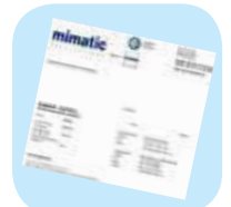
Repair, or maintenance offer