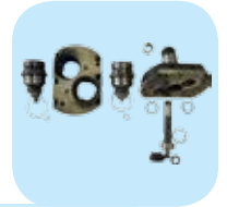
Analysis, findings and repair recommendation